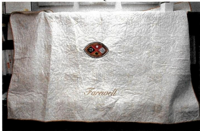
Pictured below is the ‘Farewell Quilt’